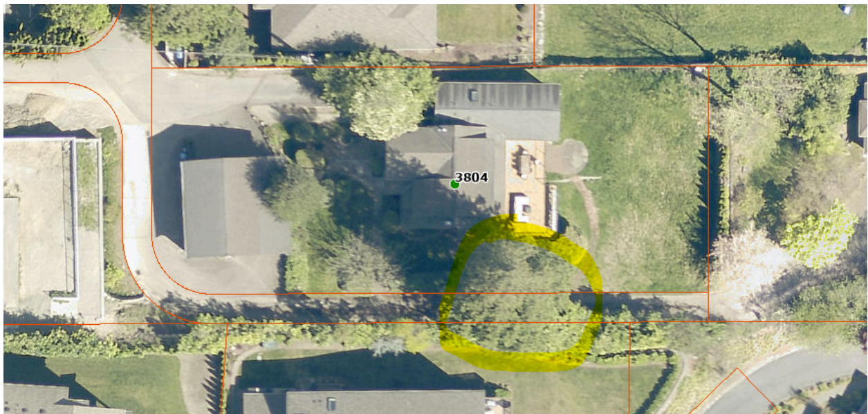
Image 2. An overview of the subject parcel with the previously removed tree circled in yellow.

No stump or visible remnants of the trees remained on-site during the field inspection. Google Maps Streetview tool was used in order to determine the approximate size of the tree prior to its removal. The imagery was captured in August 2011. The image of the tree is included on the next page of the report, which shows remnants of 1x3" decking slats, leaning against the trunk providing a reference scale.